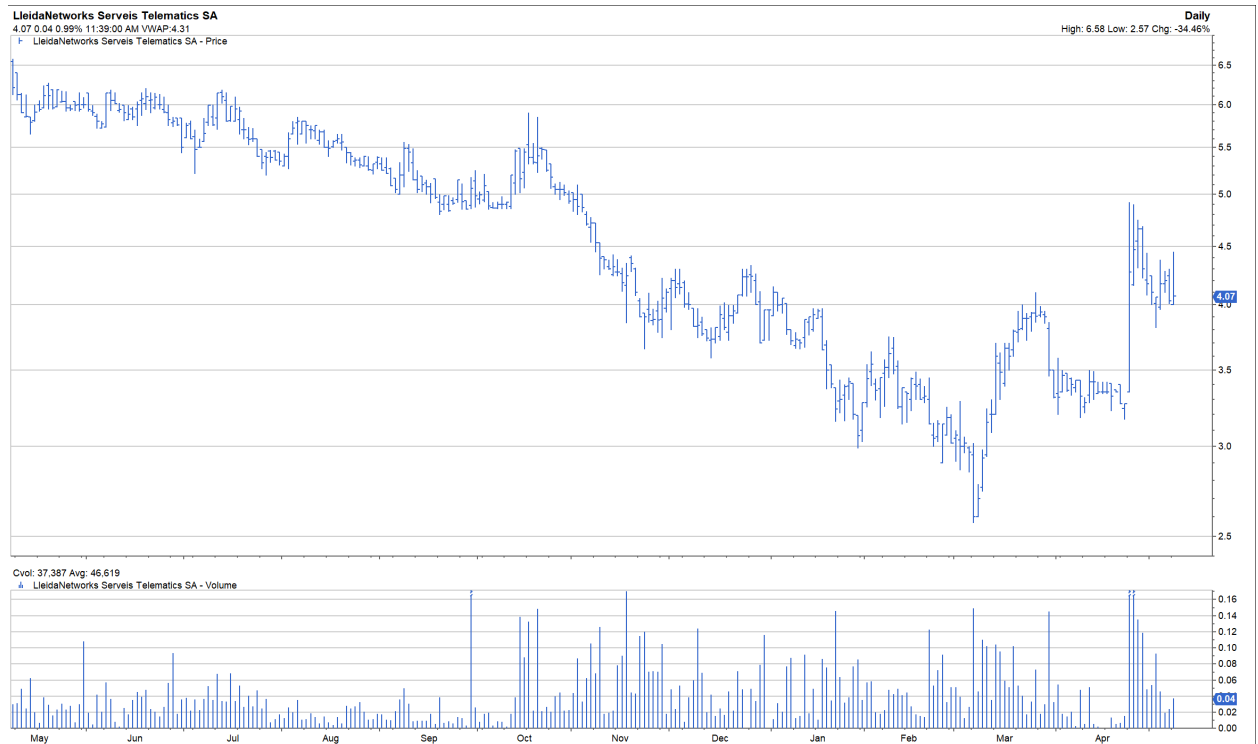
Figure 2 – Lleidanetworks Serveis Telematics SA – Trading in Madrid LTM